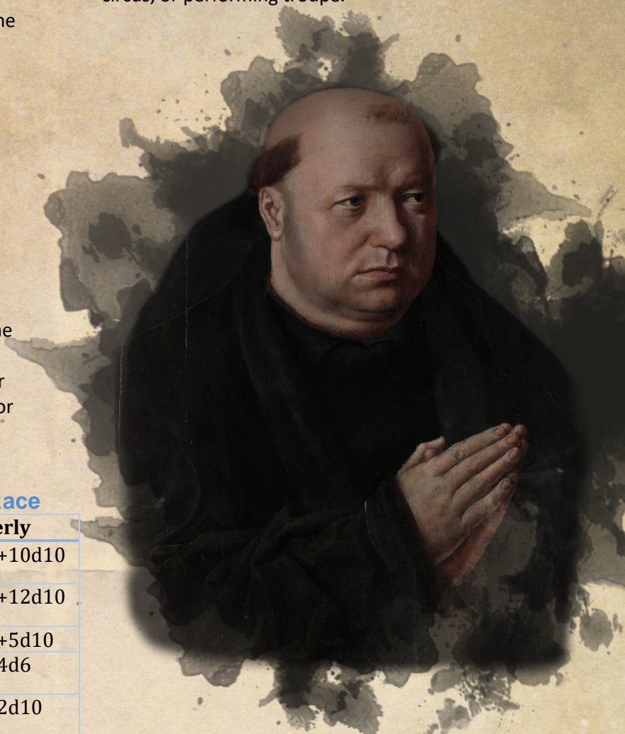
Table 1.1 on the next page shows some suggestions for alternatives to blood-relatives that you might have based on your character's background. Each one might have special factors that impact their baseline lifestyle or how easy it is to keep in contact with them. Note that the mechanics touched upon in this table are detailed further on.

or rogue could have a criminal organization, circus, or performing troupe.